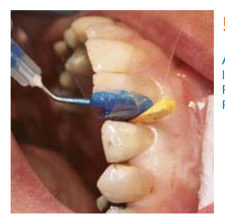
Apply Quadrant Total Etch onto enamel and dentin and leave for 15-30 seconds. Rinse thoroughly for at least 5 seconds. Remove excess moisture with a gentle stream of air.