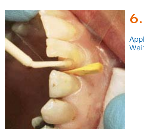
Apply 3 layers of Quadrant Uni-1-Bond. Wait for 15 seconds and light cure for 20 seconds.