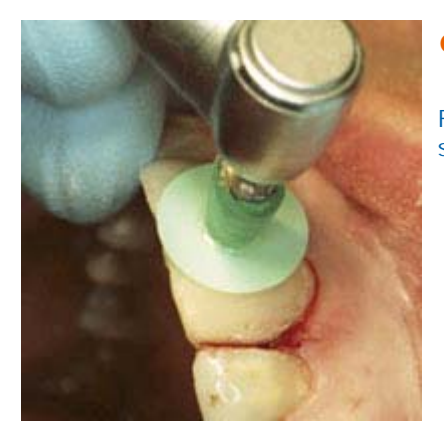
Finish with a fine diamond, and polish with flexible discs and silicon polishers.