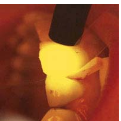
Light cure every layer for 20 seconds (for shade OA2: 40 seconds).