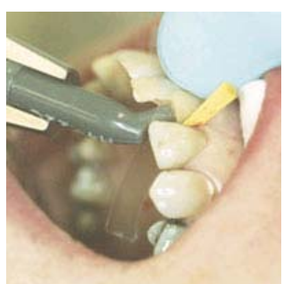
Apply Quadrant Universal LC in layers of max. 2mm in the necessary shade(s). Quadrant Universal LC is also available in syringes.