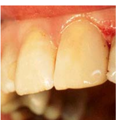
10. Result after restoration: aesthetically perfect.